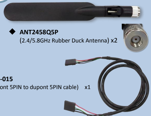
Y02-WH-015 (USB dupont 5PIN to dupont 5PIN cable) x1

As a New manufacturer of quality computer connectivity products since 2009/Mar, BPLUS technology brings to market a broad range of upgrade products. These products bridge the connection between Desktop/Notebook systems and external peripherals.