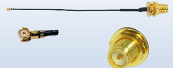
RF22008B MHF4 to RPSMA cable 8cm (WiFi)