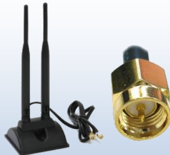
AB2450 (Strong Magnet Mount for 2.4/5.8GHz Antenna )