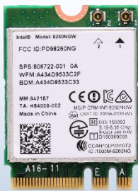
Intel® Dual Band Wireless-AC 8260