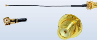
RF12008B MHF4 to SMA cable 8cm (4G / LTE / 3G / WiMAX)