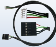
Y05-U02-060 (USB dupont 5PIN to B mini USB 5PIN cable ) x1